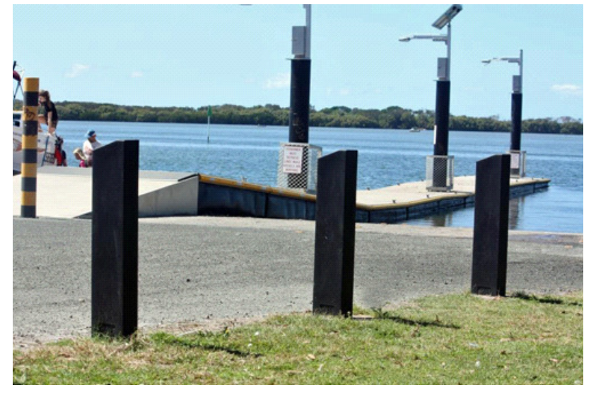
Decorative Brolga Bollards